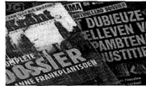
Gay Krant and Panorama publications on Demmink, October 2003

The letter recapped how in October 2003 both the Gay Krant and Panorama magazine had published an article about Demmink (not giving his name), Holland's secretary-general of justice, and his apparent involvement in child abuse. The letter also described the reaction of Demmink's direct superior, attorney general Piet-Hein Donner, when he heard about the publications: